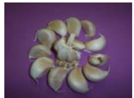
Cloves of the Asiatic garlic.

Plant bulbils at the same time as you plant garlic (October in our region). Bulbils are planted 1-inch deep about 2 inches apart. You may plant directly in the garden