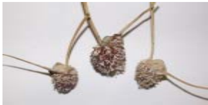
Bulbil capsule of the Porcelain Majestic garlic.

repeating the experiment numerous times. It was also obvious that help was needed if the information was to be gained during my lifetime. More data need to be collected from different regions and that data presented in a practical and usable form. I