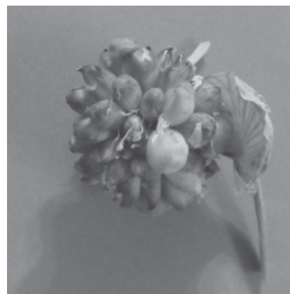
Bulbil capsule of the Turban Artichoke, specifically Lucian's Sicilian garlic.

Conclusions cannot be made from a single experiment of growing a full-size bulb from a bulbil. Sound data is based on