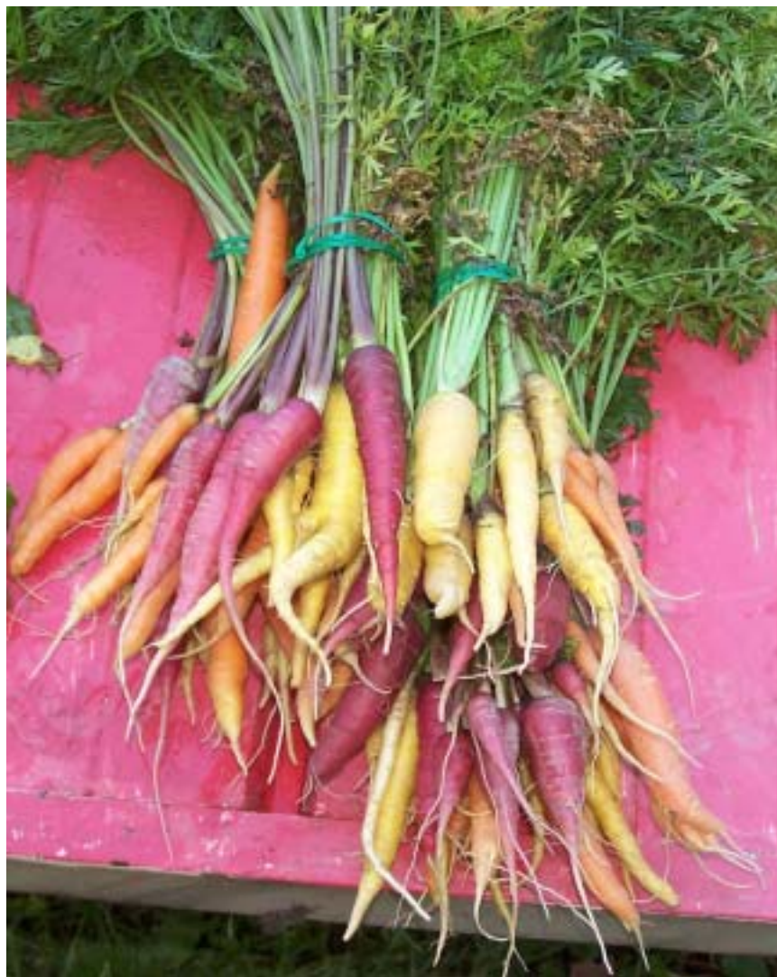
An assortment of heirloom carrots grown at Vicki's Veggies in Prince Edward County, Ontario.

It is critical to keep the lanes between the rows of carrots free of weeds. Our tool of choice is the wheel hoe. Wheel hoes are first rate technology—versatile and suitable for large backyard